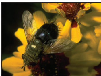
Tachinid - adult

Tachinids ( Tachinidae ) – These insects belong to a diverse family of flies that consists of 1,300+ species. These flies most commonly deposit their eggs directly on the host’s body. The eggs hatch, and the larvae burrow into the host’s body and feeds internally usually resulting in the death of the host.