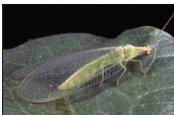
Green Lace Wing - adult