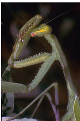
Praying Mantids - adult

( Mantodea ) – These are long slender insects with modified raptorial front legs. These insects feed on a variety of insects including other mantids. They usually lay in wait for their prey with their front legs held in a characteristic upraised position. This behavior has given the rise to their common name “praying mantids.”