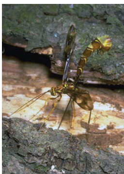
Ichneumonid - adult

( Ichneumonidae ) – These wasps vary in size, coloration, and form but tend to look slender with long, many-segmented antennae and a long ovipositor that can be longer than the insects body. The female wasp uses her long ovipositor to penetrate plants